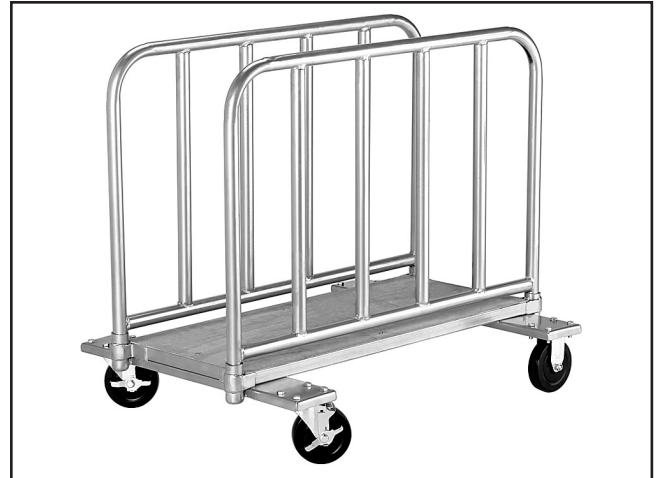
Figure 1. Model H7544.